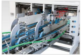
本折部/Final folding unit